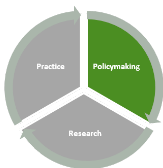
Figure 4.1 The policymaking area in the roadmap

In this chapter, the second area of the roadmap, policymaking, is presented. Here, we address related developments, motivation, main aim and strategies, and propose directions for future activities.