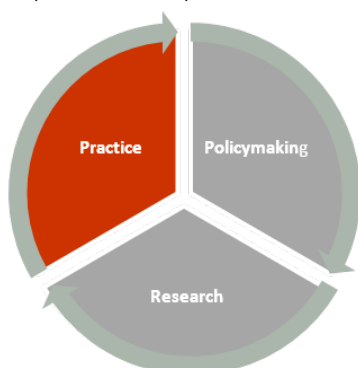
Figure 3.1 The practice area in the roadmap

In this chapter, the first area of the roadmap, practice, is presented. Here, we address related developments, motivation, main aim and strategies, and propose directions for future activities.