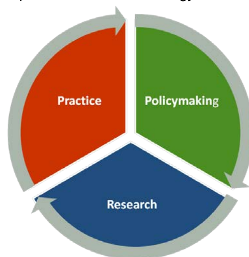
Figure 6.2 The three areas of public empowerment policies for crisis management

In this roadmap, we recommended directions for public empowerment policies for crisis management. The focus was on three areas, practice, policymaking and research, was along with cogent reasons for the need of public empowerment policies, and how we envisage their main aim and the components of such a strategy.