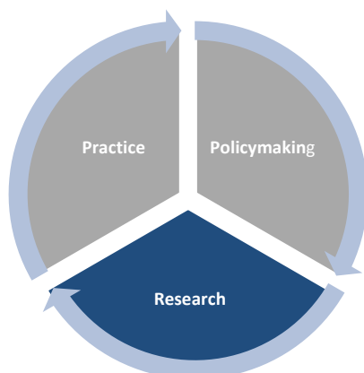
Figure 5.1 The research area in the roadmap

In this chapter the third area of the roadmap, research, is presented. Here, we address related developments, motivation, main aim and strategies, and propose directions for future activities.